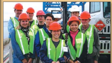
Members tour Port of Boston cargo facilities