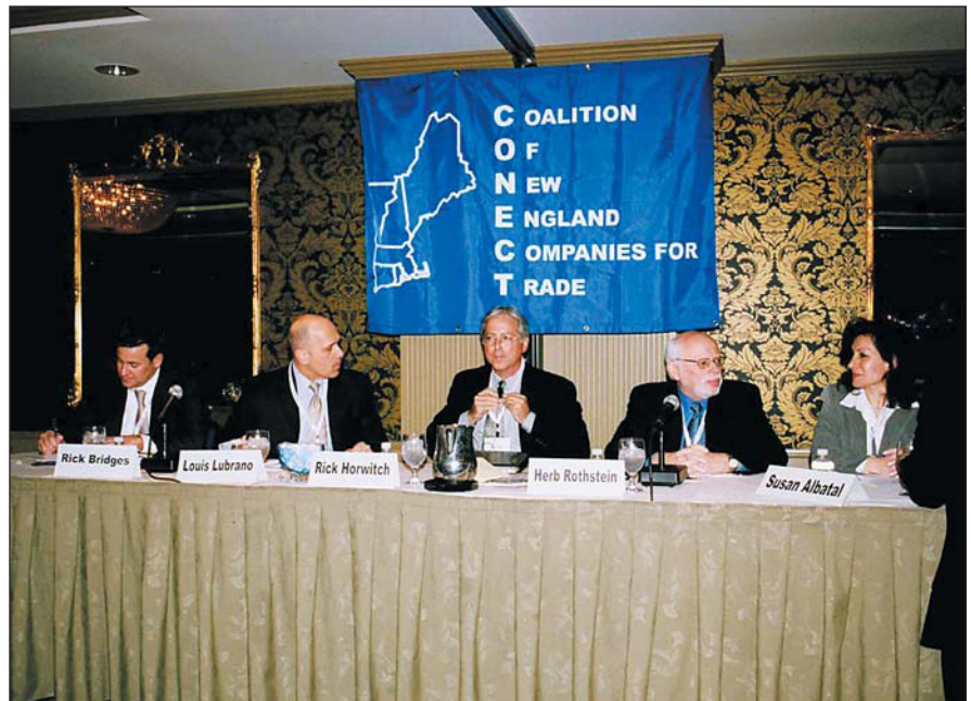
The 2008 Northeast Trade and Transportation conference in Newport, R.I., brought CONECT members together with top industry speakers.