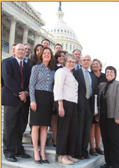
CONNECT 7 Briefing 2008

"Dedicated to Promoting Free and Fair Trade"