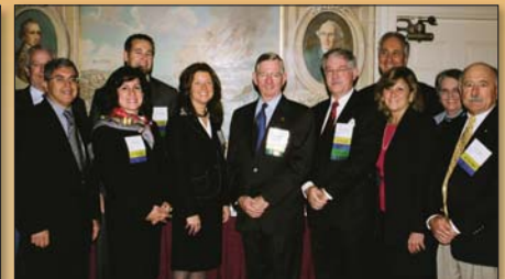
CONNECT hosts CBP Commissioner Basham